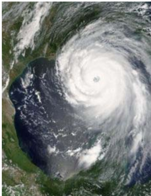
NASA satellite photo Hurricane Katrina near peak strength on August 28, 2005